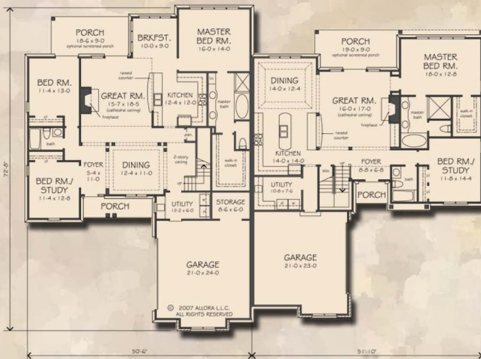
THE AUGUSTA MAIN LEVEL